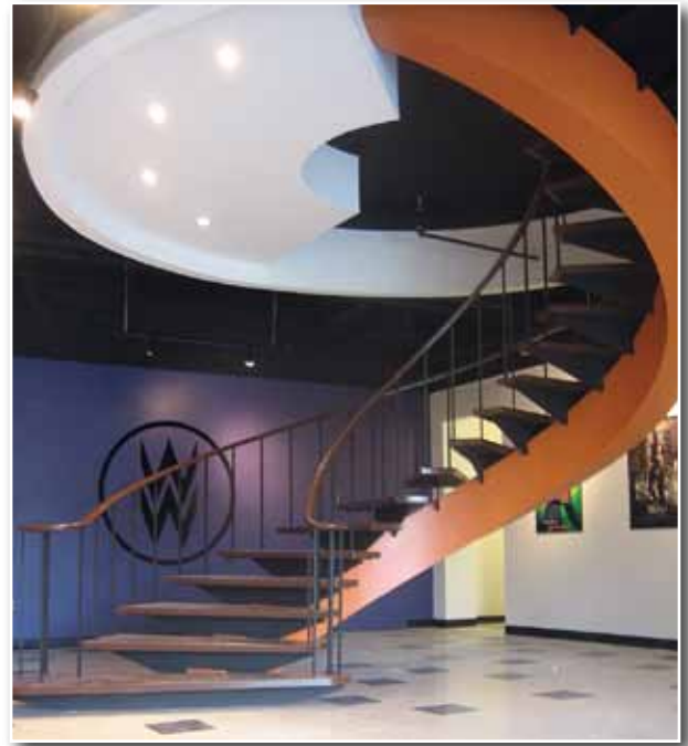
WFW Centre central lobby area

We've come quite a distance since day one, but it's only just the beginning of an even longer journey that awaits us. With our sights set now on the 'Official Launch' of the WFW Centre on June 23, 2011, not only are we bigger and better than ever, we're going to look good while we do it.