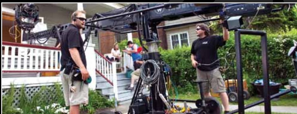
WFW Moviebird 17 with Stabilized Scorpio on location in Toronto for "Gain" detergent - Radke Films-PM Greg Jones