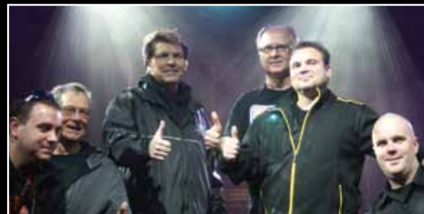
WFW partners with Maximum Entertainment and Christie Lites to produce the annual SJR rock show in Winnipeg.