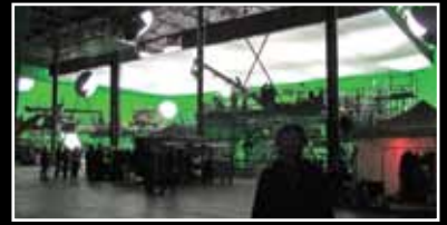
Green screen from the set of Final Destination 5