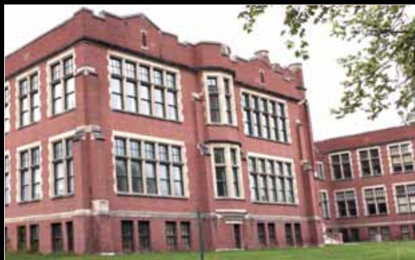
WFW relocates to the Canada Saskatchewan Production Studios in Regina

We are proud to announce that Canada's leading provider of professional production equipment has relocated to Canada Saskatchewan Production Studios, the largest production facility in the Prairies, on December 1, 2010. Our relocation reaffirms our long-standing commitment to the Saskatchewan production industry and we remain truly committed to providing the region's production professionals with the tools they both require and deserve. William F. White is proud to be the only provider of professional support with offices from coast to coast.