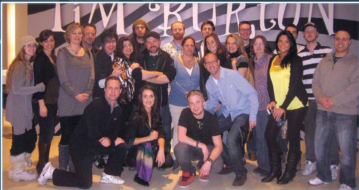
WFW Toronto Staff Outing to the Whites-Sponsored TIFF Bell Lightbox