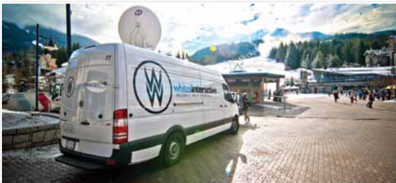
Whites Interactive Viral Van on location in Whistler, B.C

Swing by Whites anytime to check out this amazing package today!