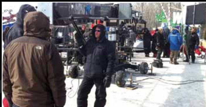
WFW SuperTechno 50 Crane on location in Winnipeg for "Beethoven's Christmas Adventure" -Universal Studios Home Entertainment Prod's.