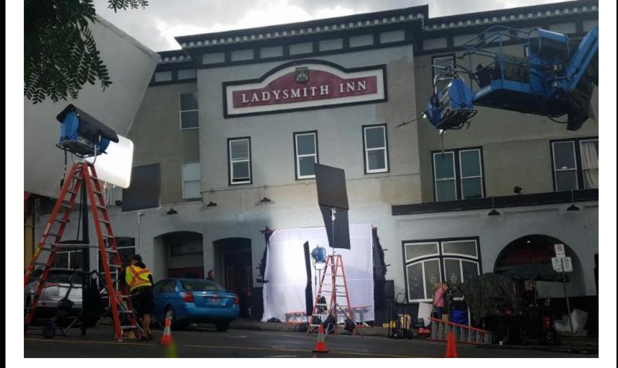
An ARRI M90 and two 18K HMI ARRIMAX fixtures lighting the set of Sonic the Hedgehog in Ladysmith, BC

Sonic the Hedgehog is an upcoming live-action animated Paramount Pictures film based on the popular video game series. Plot details are sparse, but the games feature an anthropomorphic blue hedgehog with supersonic speed who must stop the mad scientist, Dr. Robotnik.