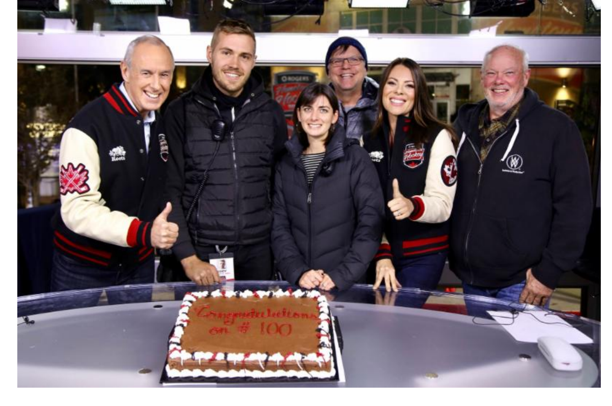
Hometown Hockey hosts and crew gather to celebrate 100th episode

Whites Toronto has been partnering with SDI Marketing to provide Rogers Hometown Hockey with the necessary load-sharing generator power and support to run the celebrated cross-country event since its inception in 2014.