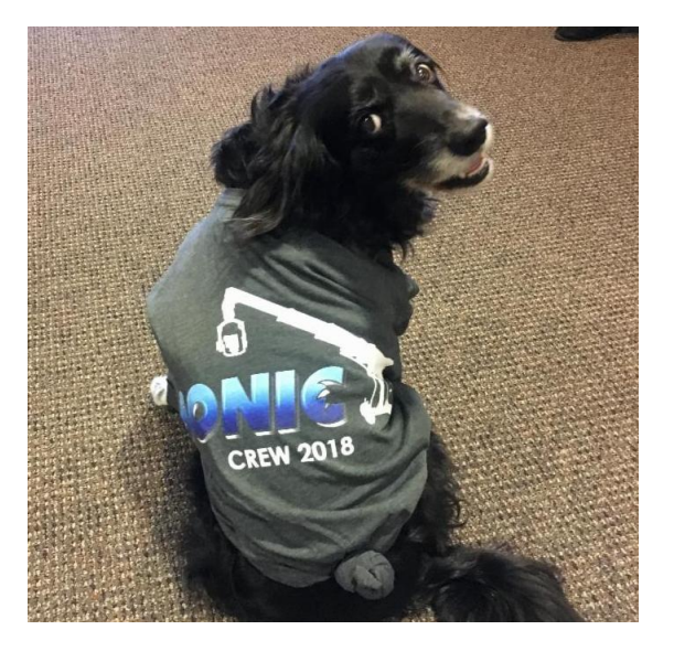
A faithful member of the Sonic film crew