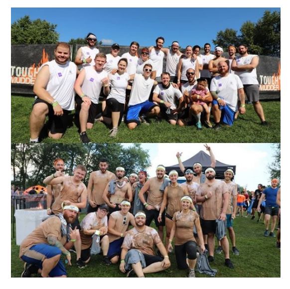
Before and after shots of our 2018 Whites Tough Mudder team