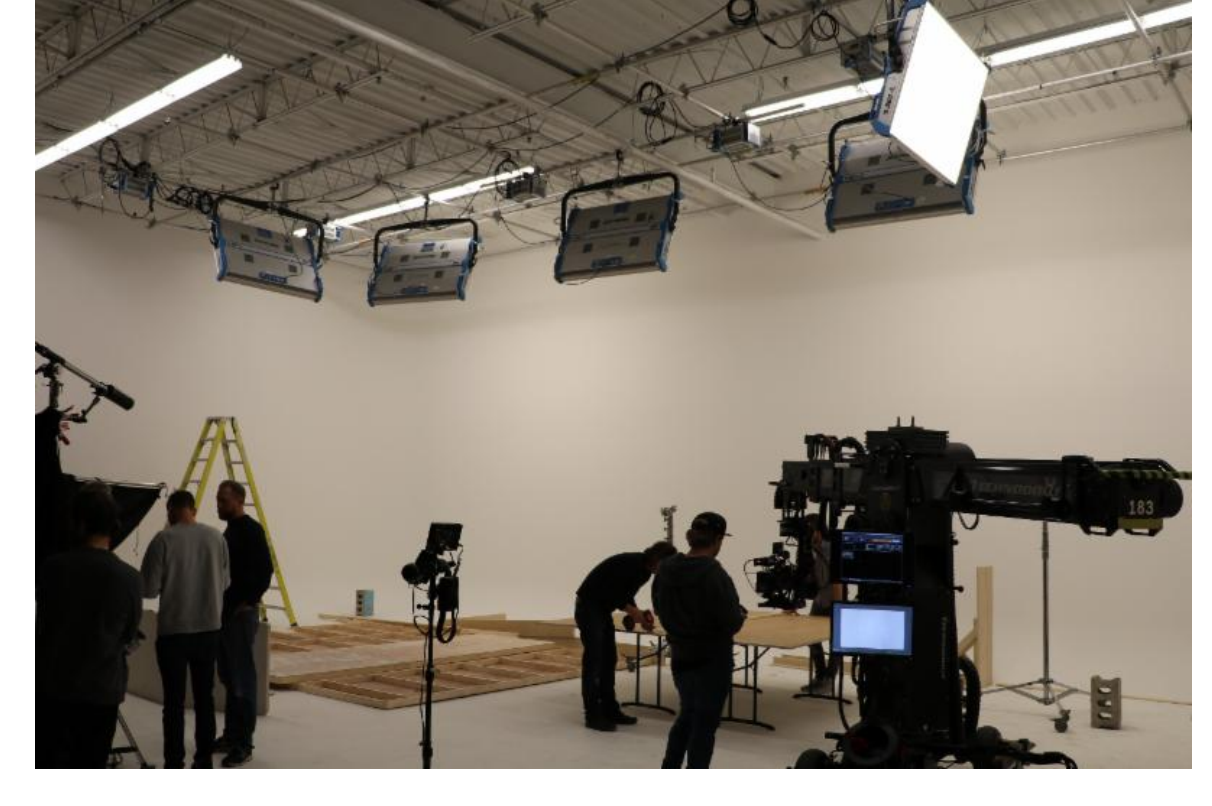
Commercial client, Unreasonable Studios, shooting a Hershey's spot in the newlyrenovated Whites Space located at the William F. White Centre in Toronto

Whites Space is our in-house studio located at the William F. White Centre. This past fall, it underwent construction to incorporate washrooms, hair-and-makeup rooms and air conditioning.