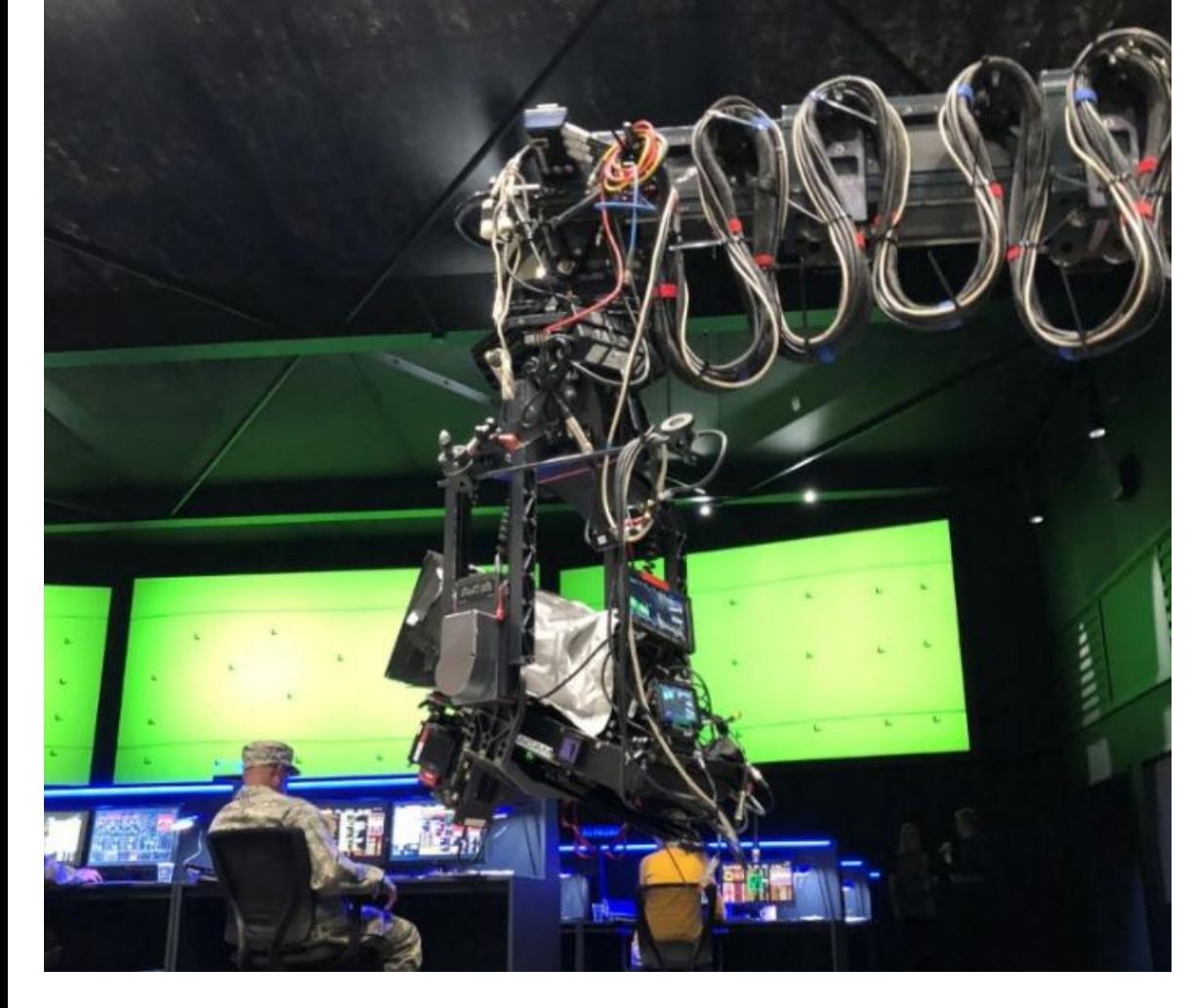
Our RED Weapon 8K Monstro camera and Alpha Stabilized remote head attached to a SuperTechno 30 crane on the set of Asteroid Impact at the Calgary Film Centre in Calgary

Asteroid Impact is a large-format 3D educational documentary produced as part of the IMAX Original Film Fund, an initiative created in 2014 to bring meaningful true stories to IMAX theaters.