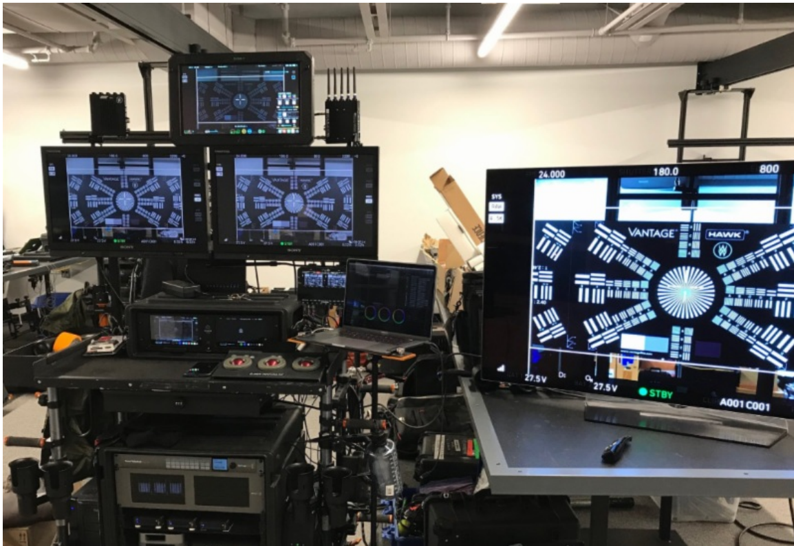
The Digital Imaging Technician (DIT) HDR workflow station for Windfall at Whites Camera in Vancouver

Windfall is an upcoming thriller feature fully-serviced with our camera, lighting, grip, location support and specialty equipment set to debut on Netflix in 2020.