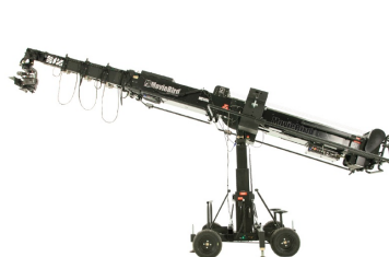
MovieBird 50 XL camera crane