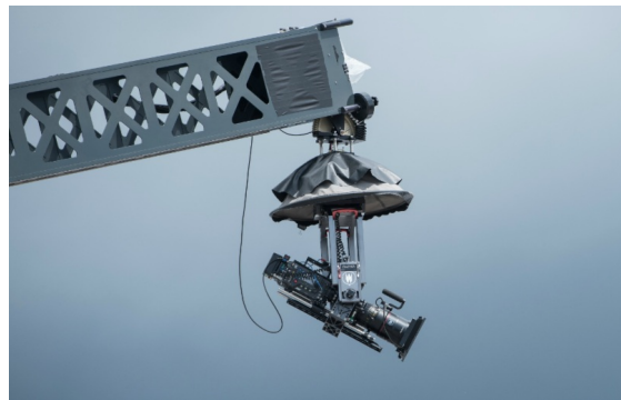
Our ARRI Alexa SXT Camera with Angenieux Optimo lens attached to an Alpha Stabilized remote head

On Sunday June 23rd, we held our second annual Summer Sizzle open house event. Over 600 people visited our Vancouver office to enjoy an afternoon of live music and delicious food surrounded by an impressive display of state-of-the-art production equipment.