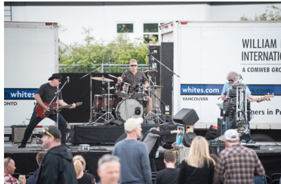
Live bands entertained guests throughout the day