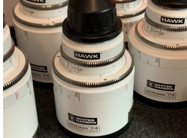
Hawk Vintage 74 lenses