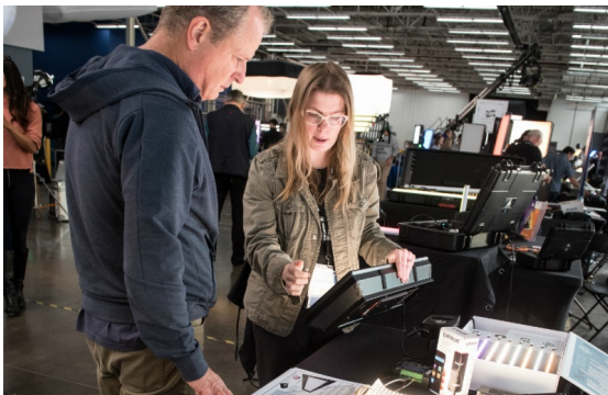
Moss LED along with other vendors on the Summer Sizzle vendor show floor