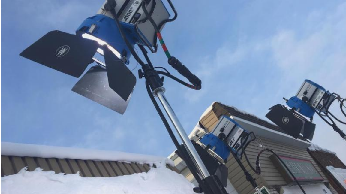
Our ARRI M-Series of lights on the set of Tainted in Sault Ste. Marie, Ontario

Earlier this year, our Sudbury location provided lighting, grip and specialty equipment to Tainted , a crime drama from Toronto-based Gearshift Films starring John Rhys-Davies of Lord of the Rings fame.