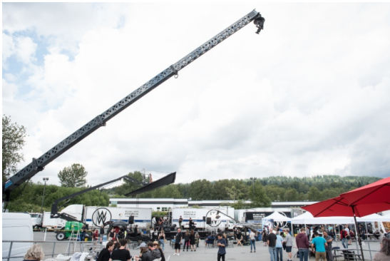
Our SuperTechno 100R taking a little stretch over attendees below