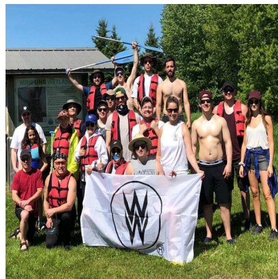
Whites Toronto employees and friends enjoyed a beautiful day of canoeing and kayaking through the Minesing Wetlands this summer