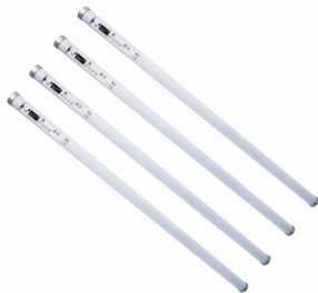
Astera Titan Tube LED