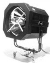
ArcLight Xenon 10K