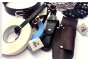
Canadian Handmade Red Dog Leather Products