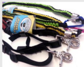
Canadian Handmade Strap 550 Rugged Camera Straps