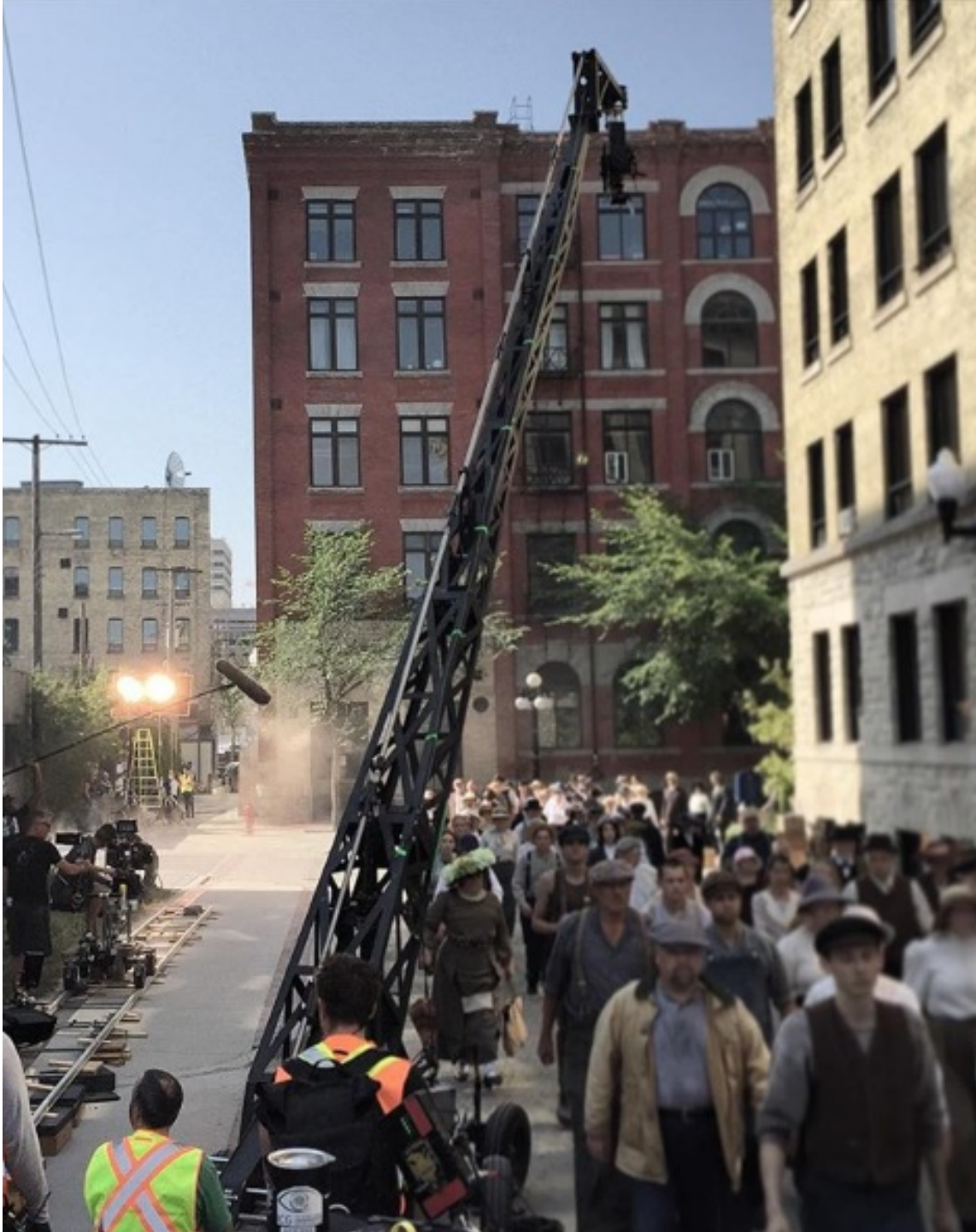
Our Giraffe Crane capturing a scene on the set of Stand! in Winnipeg