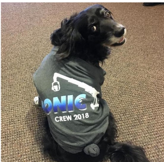
A faithful member of the Sonic film crew