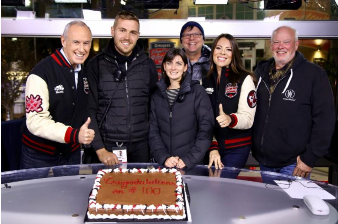
Hometown Hockey hosts and crew gather to celebrate 100th episode

Whites Toronto has been partnering with SDI Marketing to provide Rogers Hometown Hockey with the necessary load-sharing generator power and support to run the celebrated cross-country event since its inception in 2014.