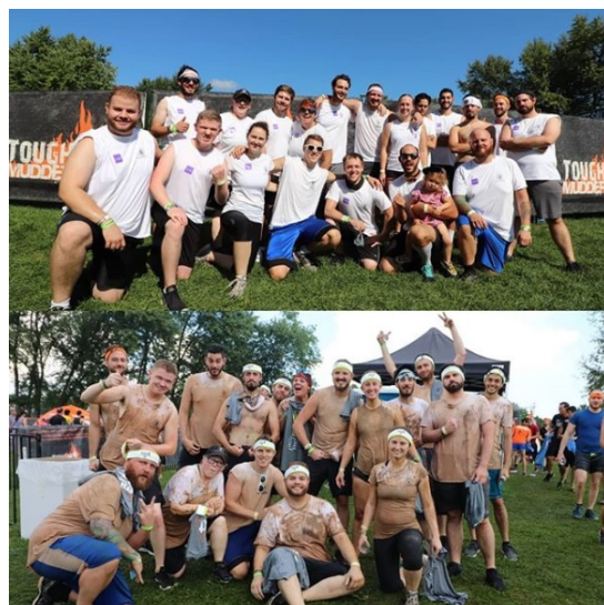
Before and after shots of our 2018 Whites Tough Mudder team